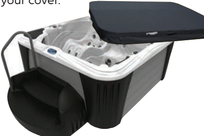
Suite Steps and Handrail with Storage Wide steps with sturdy handrail and side compartments for

Weather and fade resistant lockable energy saving cover with locking safety straps. Plus, convenient cover lifter for opening, replacing and handling your cover.