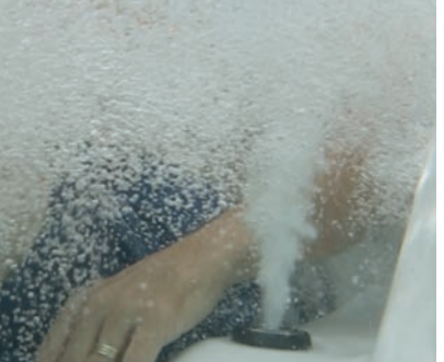
Foot Reflexolgy direct to the bottom of each foot